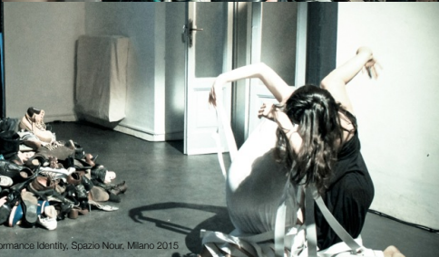
Performance Identity, Spazio Nour, Milano 2015