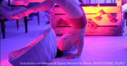
Una notte con Ramona at Spazio Recherche, Roma

Per attivare questo dispositivo rispondi alle seguenti domande attraverso messaggi