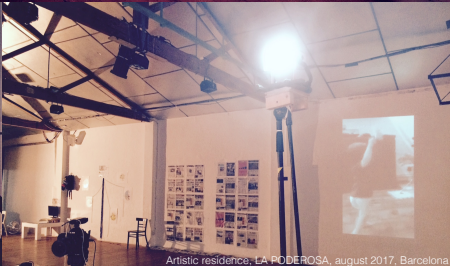
Artistic residence, LA PODEROSA, august 2017, Barcelona