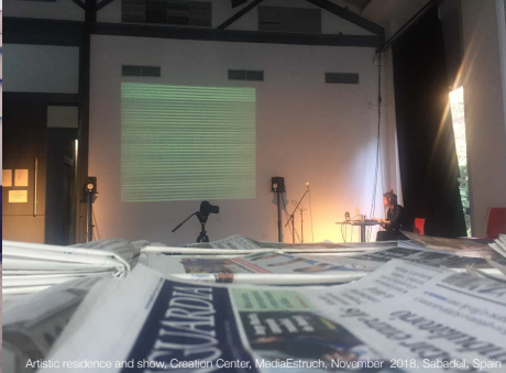
Artistic residence and show, Creation Center, MediaEstruch, November 2018, Sabadell, Spain