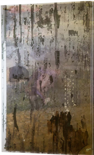
Ulisse 2016 mixed media on plexiglas cm 55x30

Stratificazione d'identità investigates the theme of identity research. The installation project is the result of a research that develops through video-performance-painting-photography languages. Only a light and invisible layer divides reality from illusion. To what extent do we see what is real? How far do we believe in illusion? Fragmentation is an approximation to reality, but so is the overall vision "... we are no longer alienated or dispossessed: we are in possession of all the information. We are no longer spectators, but actors in the performance, and increasingly integrated into its performance. While we could face the unreality of the world as a show, we are instead defenseless in front of the extreme reality of this world, in front of this virtual perfection ...". J. Baudrillard