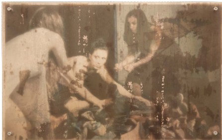
Identità effimere 2016 mixed media on plexiglass cm 40x20