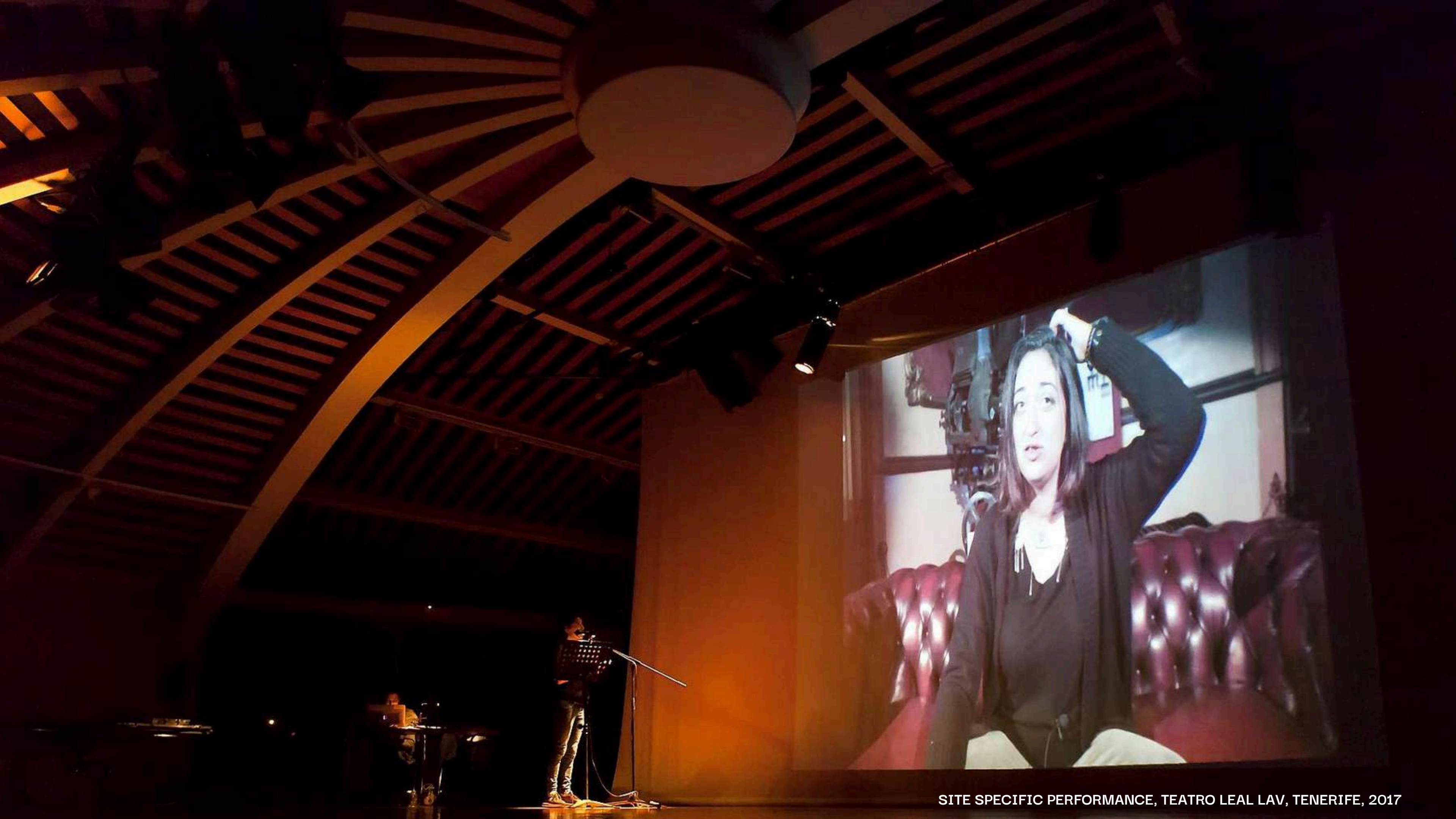
SITE SPECIFIC PERFORMANCE, TEATRO LEAL LAV, TENERIFE, 2017