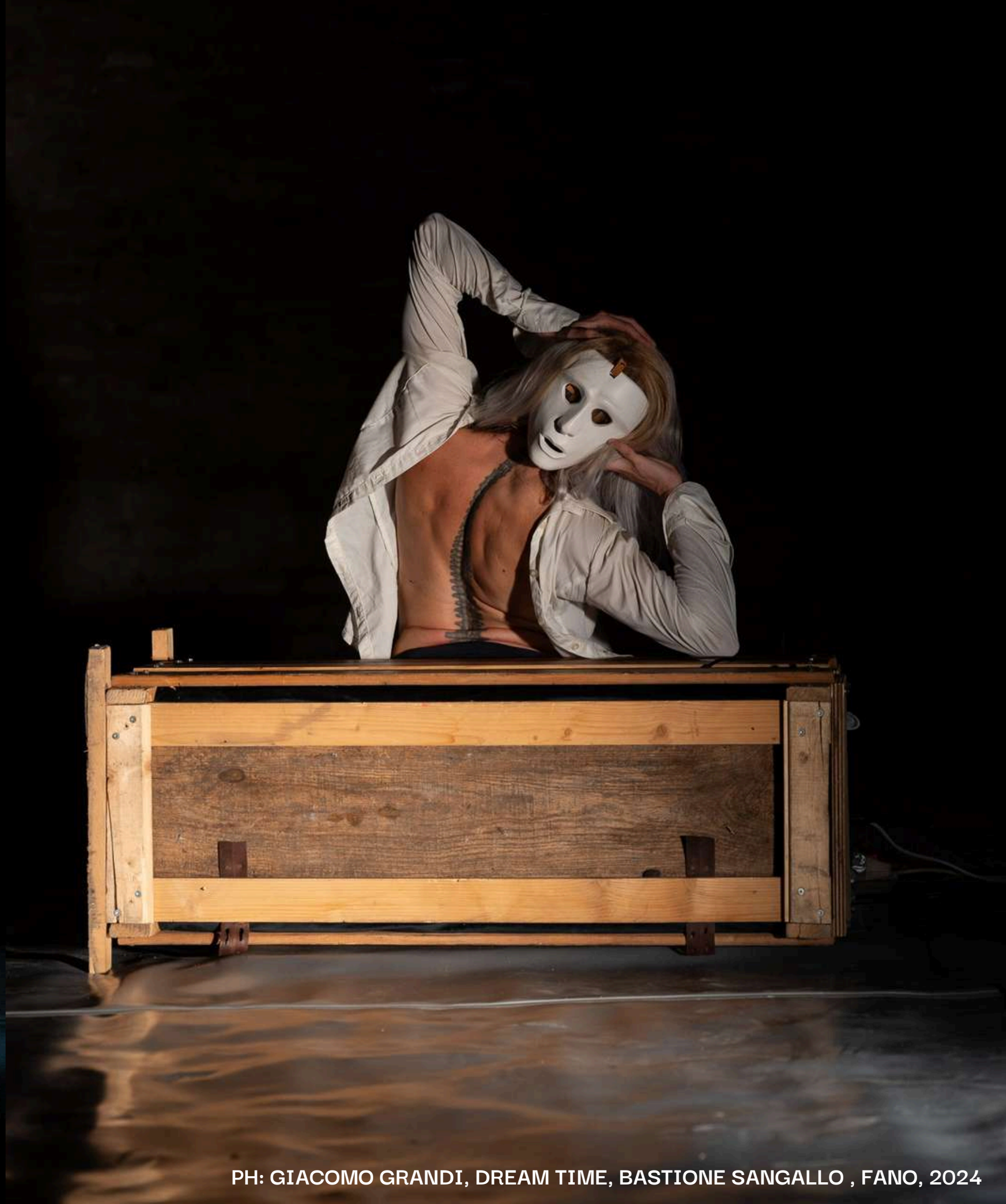
DREAM TIME, BASTIONE SANGALLO , FANO, 2024