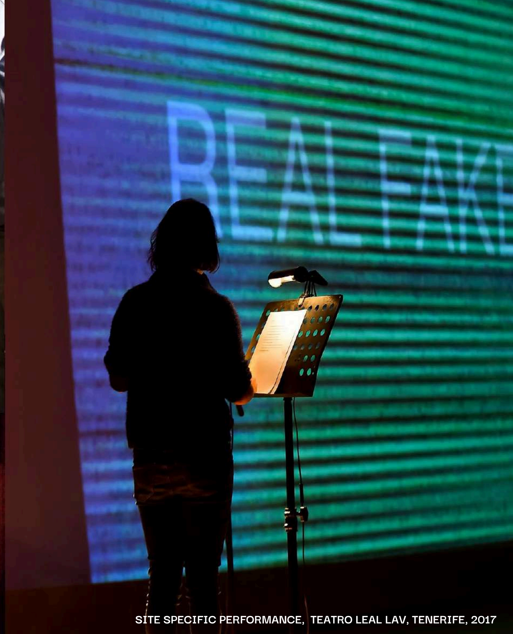
SITE SPECIFIC PERFORMANCE, TEATRO LEAL LAV, TENERIFE, 2017