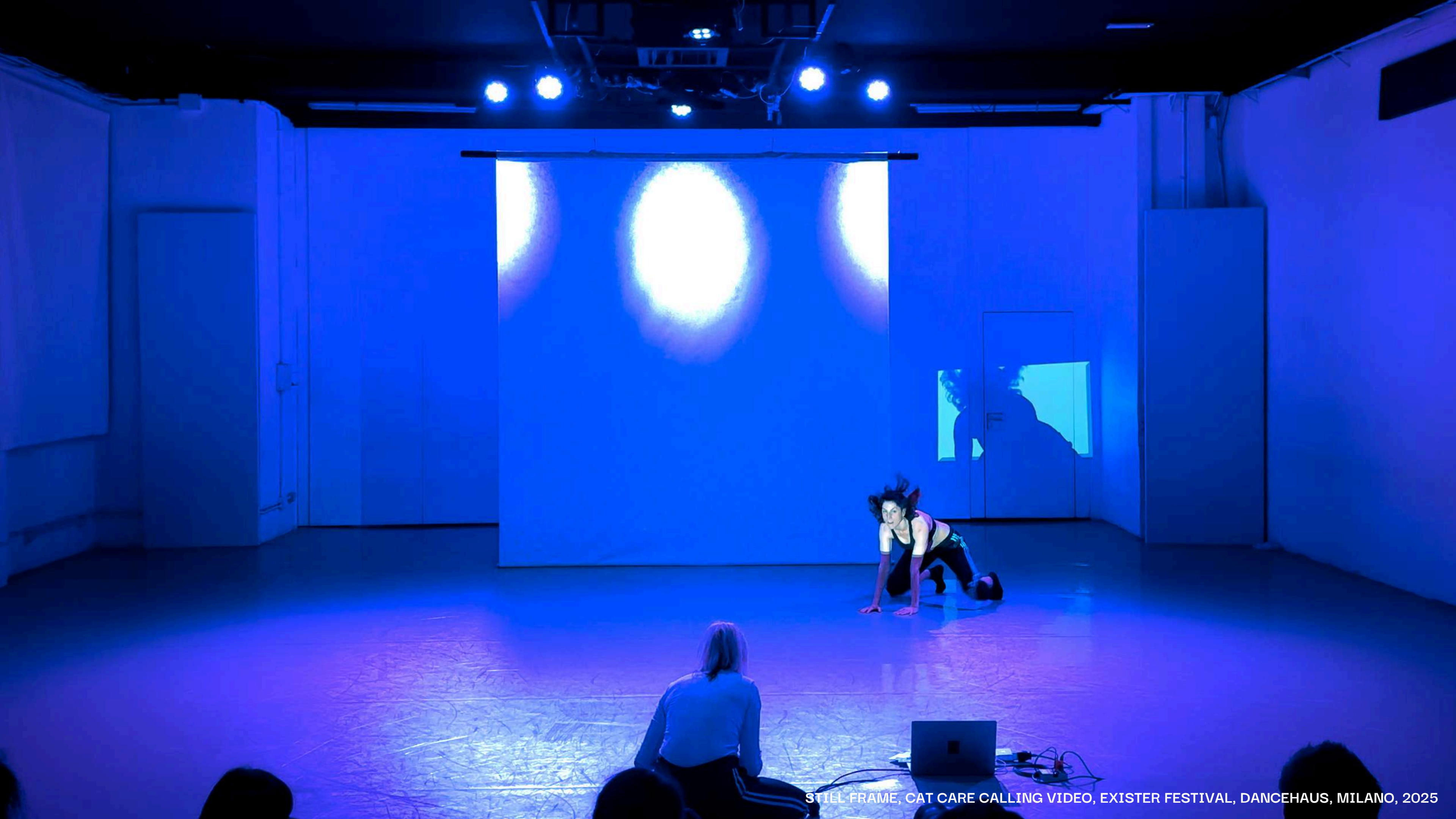
STILL FRAME, CAT CARE CALLING VIDEO, EXISTER FESTIVAL, DANCEHAUS, MILANO, 2025