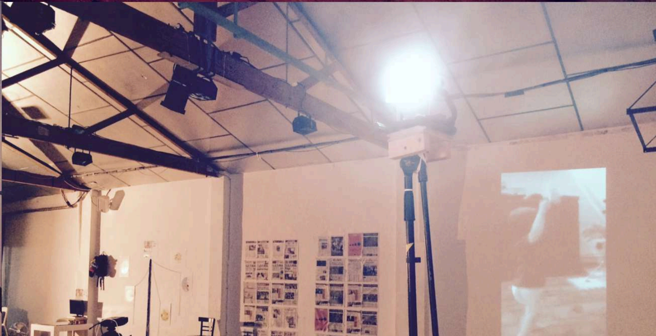
SITE SPECIFIC PERFORMANCE, LA PODEROSA, BARCELONA, 2017