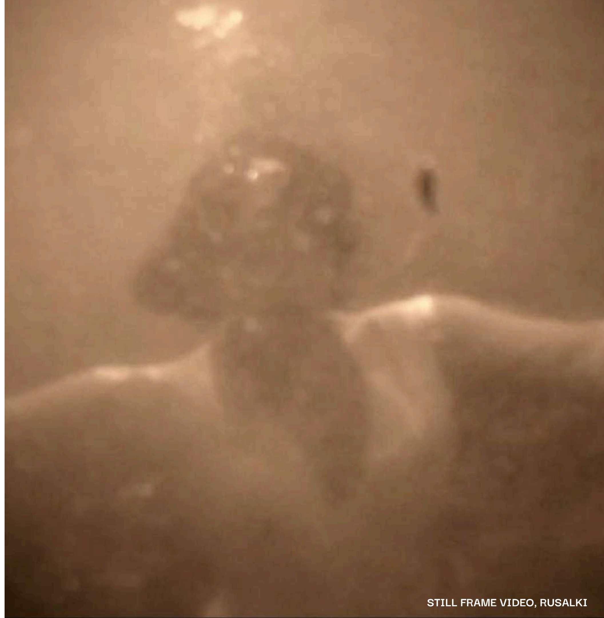
STILL FRAME VIDEO, RUSALKI